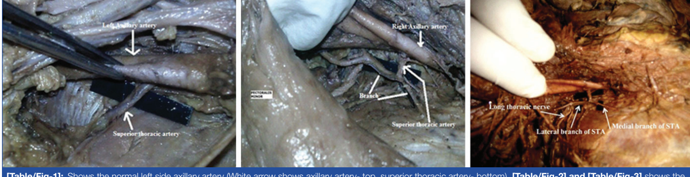
[Table/Fig-1]: Shows the normal left side axillary artery (White arrow shows axillary artery- top, superior thoracic artery- bottom). [Table/Fig-2] and [Table/Fig-3] shows the right side axillary artery. Note the variation in the branching pattern of STA when compared to its usual course on the right side (In Table/ Fig. 2 White arrow points the axillary artery- top, bend arrow points superior thoracic artery and the bottom arrow points the variant medial and lateral branches of STA. In Table/ Fig. 3 the white arrow in the left points on the long thoracic nerve, the middle and right arrow points the variant medial and lateral branches of STA)

Usually STA is small branch in case of males and it courses down beneath subclavius muscle and anastomose with internal thoracic artery and intercostal arteries [11]. There can be numerous reasons of the variation in normal branching pattern of axillary artery and it could be due to the defects of neighbouring tissue and also defects